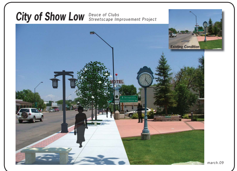
A rendering of the Deuce's south side as it looks today and how it will look with wider sidewalks and landscaping.