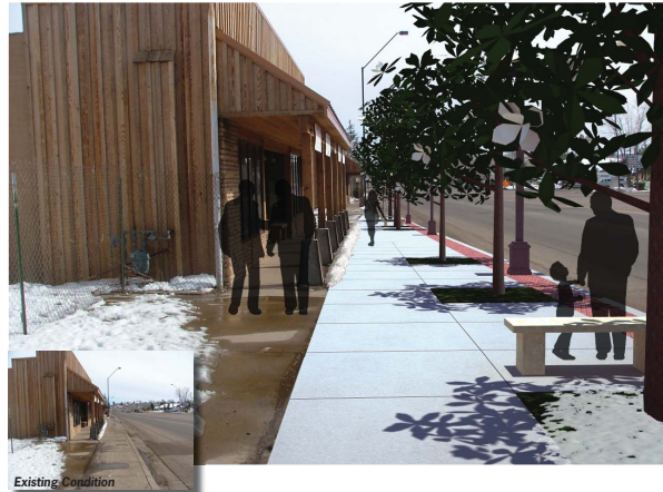
The Deuce's north side design.